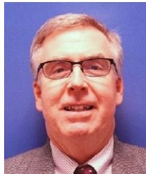
Director: Christopher W. Nolan